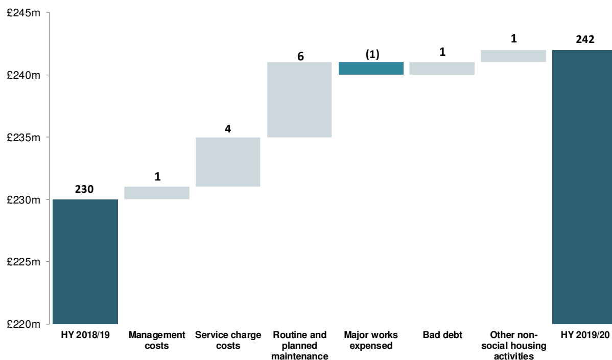
Figure 2: Movement in operating costs (£m)

At £242 million, operating costs are £12 million (5%) higher than the same period last year, resulting in an operating cost per unit of £2,224 (H1 2018/19: £2,119).